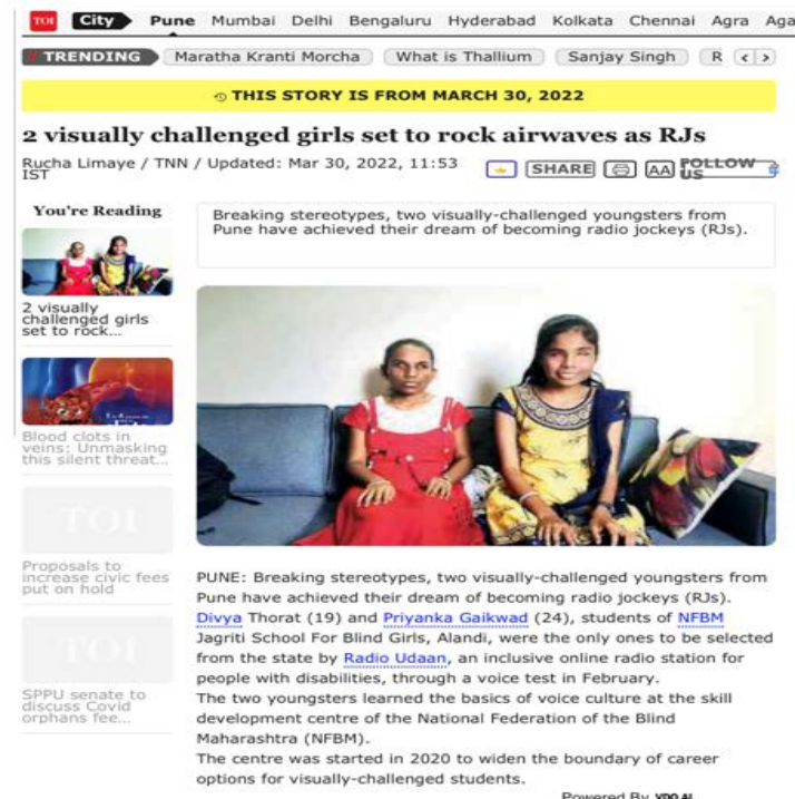
Figure 5: News covered by Times of India

shows, and showcase their talent. They also offer employment opportunities for visually impaired people. Along with that, they organise a variety of activities and events for the welfare of the community. Through Radio Udaan, they served the community with information, skills, and awareness and raised issues that were ignored by society (Figures 4 and 5).