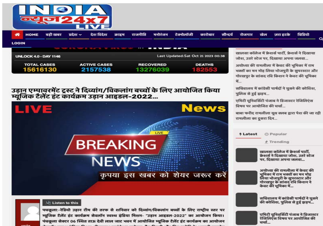
Figure 2: News published by India News 24 x 7